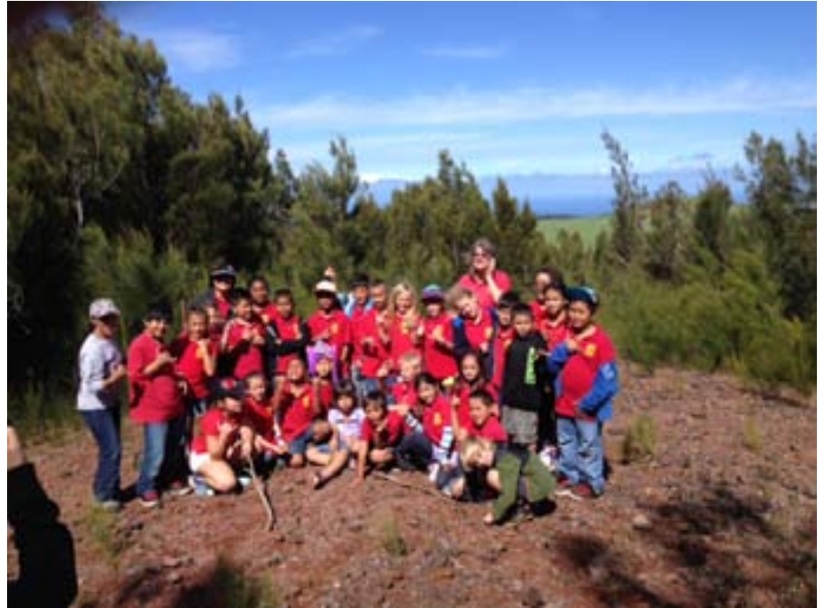
A beautiful day at Puanui and on Pu'u Kehena.