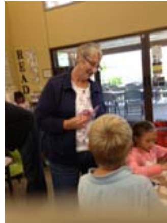
Haumāna enjoyed creating various art projects with Aunty Linda.