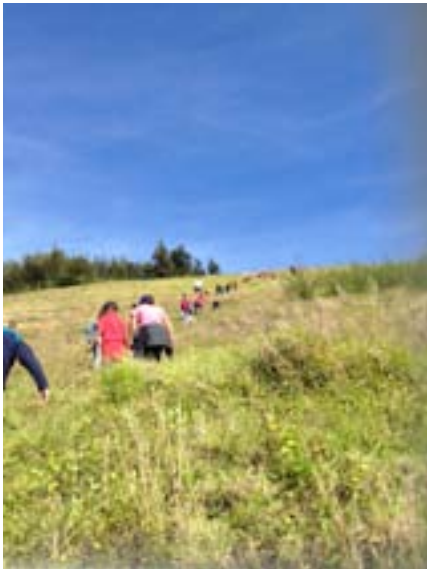
Ascending Pu'u Kehena at Puanui.